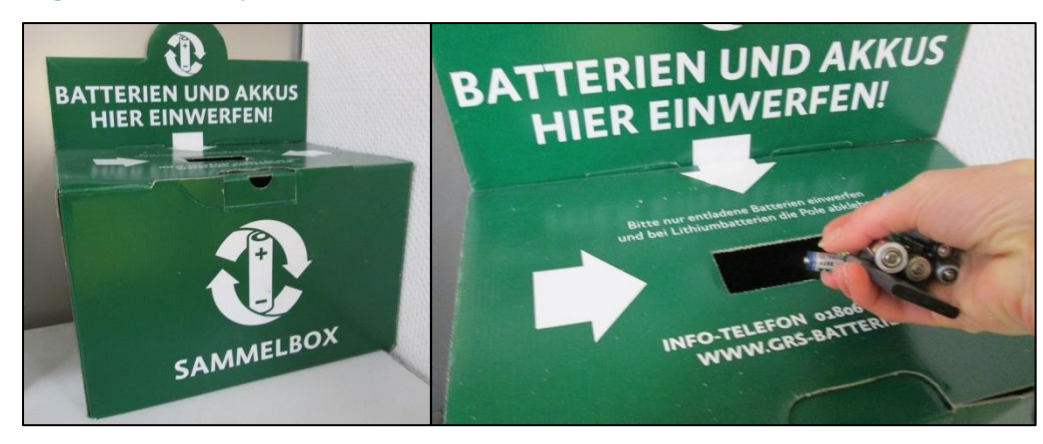
Figure 2: Battery collection boxes near the checkout in a local German supermarket

Collection campaigns seek to place battery collection recepticles – often cardboard boxes, plastic bags or, increasingly, reusable plastic drums – in easily accessed public locations. The colour-coded recepticles indicate the types of batteries to be collected and encourage individuals to separate damaged batteries from those that are simply discharged. Some collection schemes have installed telemetry systems to inform the battery collection agency when pickup is ideal to maximise returns. [RECHARGE 2015] Depending on the breadth and ambition of the campaign, average collection costs vary per country.